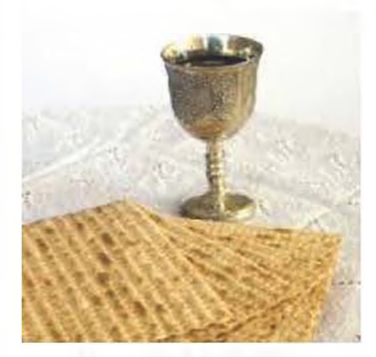
Menu & details TBA.

Following 5:30 pm Kabbalat Shabbat & Holiday services, at 6:15 pm